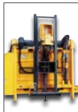
Elevator (In kit) For feeding higher than with the standard machine (+ 0,80 m).