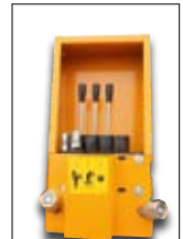
Manual control Manual control fitted on an adjustable arm.