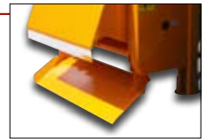
Feeding tub Tub with big width for grass and maize silage. Tub opening at the same time as the chain-bed advancing.