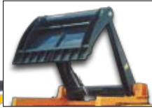
Round silage unloading claw Claw with automatic scraper in kit.