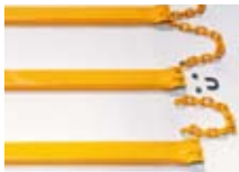
Chain-bed Bars bolted on chains (seamless). Tightening of the chain bed adjustable from the outside.